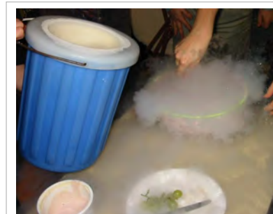
Lone Star A&M students preparing homemade ice cream with liquid nitrogen