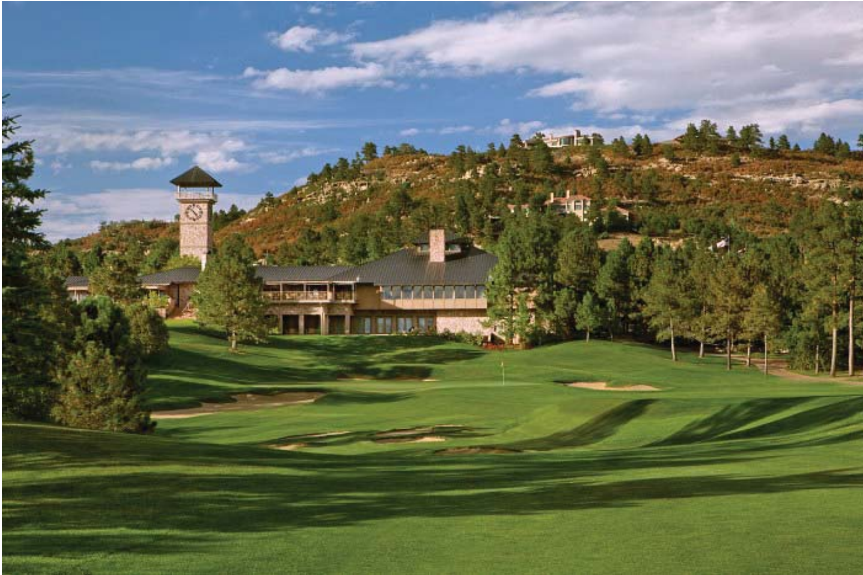
Castle Country Club