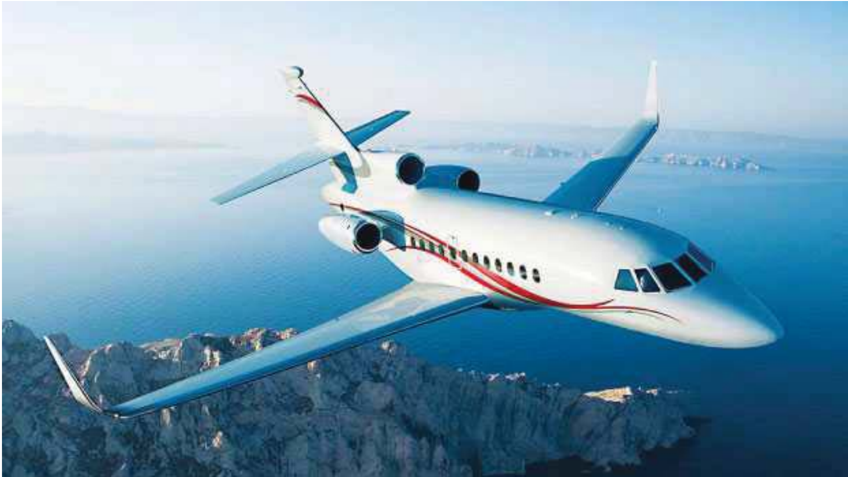
Leased Azoff jet