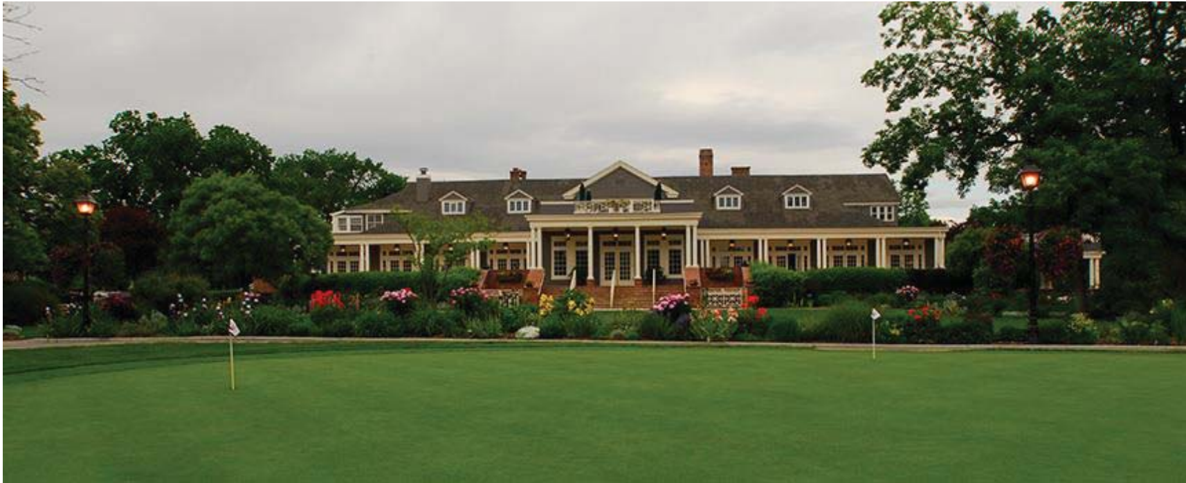
Lone Star Country Club