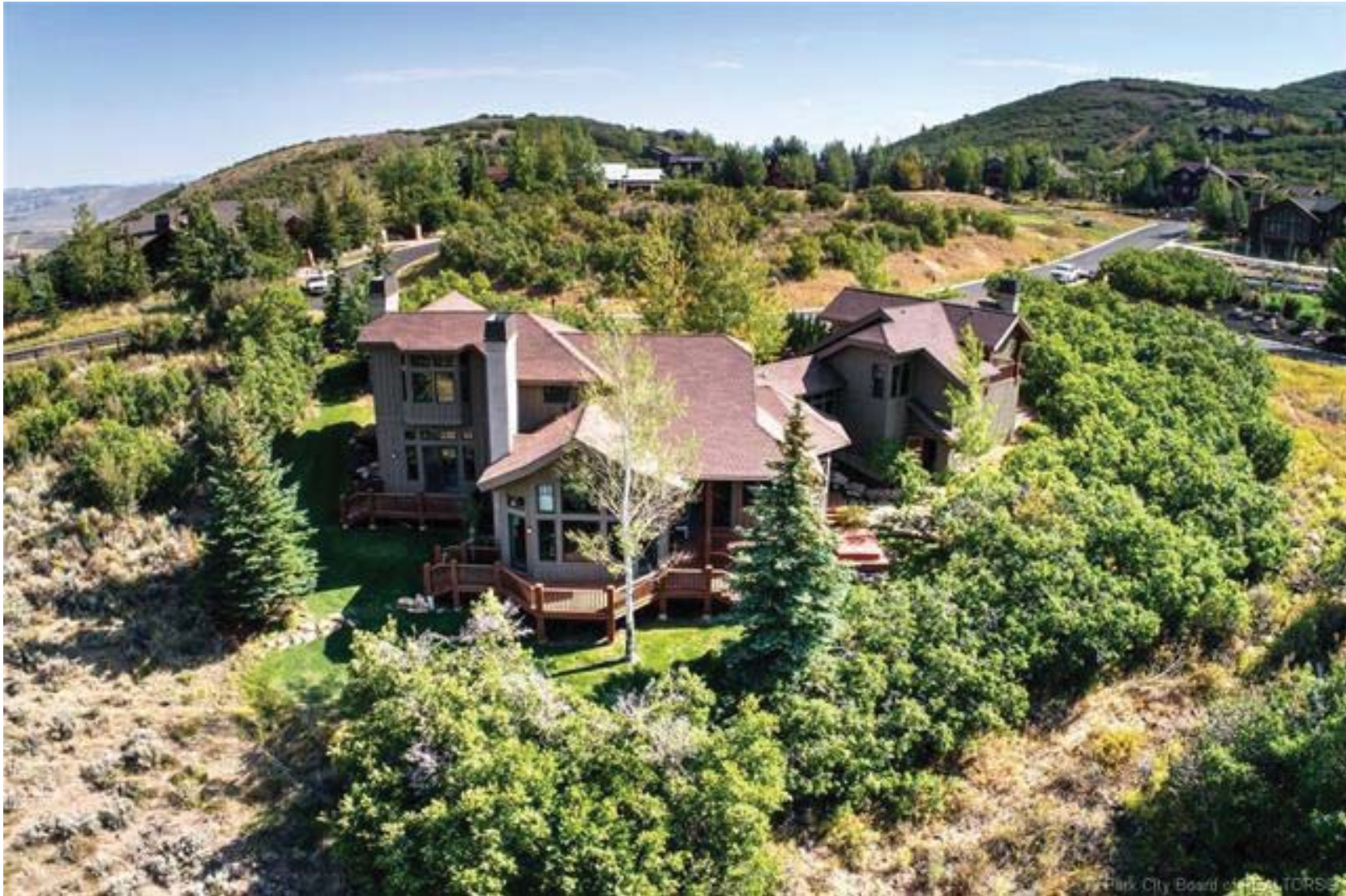
Azoff Home in Deer Valley