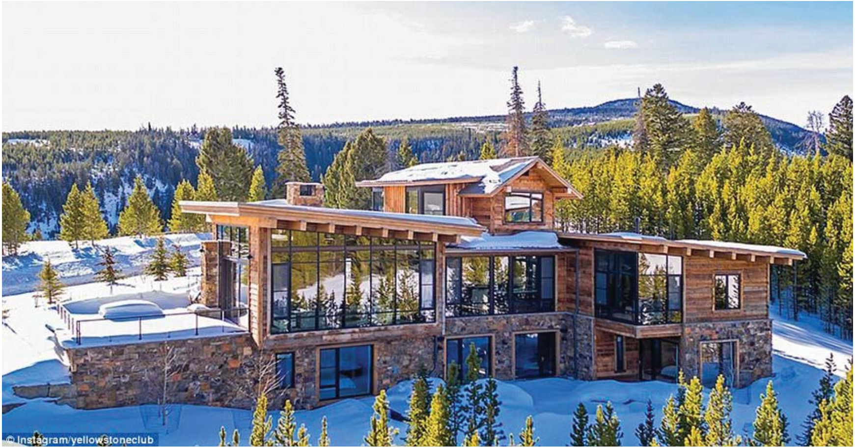
Belfort Home in The Yellowstone Club